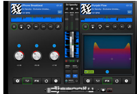
DJ App, DJ Spooky aka Paul D. Miller.

In this workshop, multimedia artist, composer and writer Paul D. Miller aka DJ Spooky expands the concept of DJ with elements of conceptual art, sound art, layering, collage, loops and layers. From his popular DJ app for iPad, which has enjoyed over 12 million downloads, to his multimedia composition, book, and installation The Book of Ice , DJ Spooky will discuss how technology has shaped creativity throughout history and continues to influence how we actualise the future.