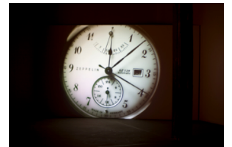
Alex Davies, detail from The Very Near Future , 2013

The Spectres and Shadows workshop explores the creation of illusionary characters within the clock set piece of the installation The Very Near Future that was presented in 2013 at ISEA and Sydney Festival. Participants will gain insight into the production process utilised to record and process video with the aim to give a fleeting impression of the presence of shadowy people co-existing in the environment with the audience. Participants will also gain an understanding on how these media elements can be controlled and presented in a dynamic fashion via computer hardware and custom software.